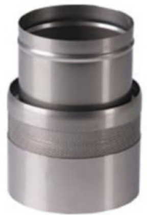
Smoothing inlet WISY EB0300US

NOTE: Dimensions shown in parentheses are in millimeters.