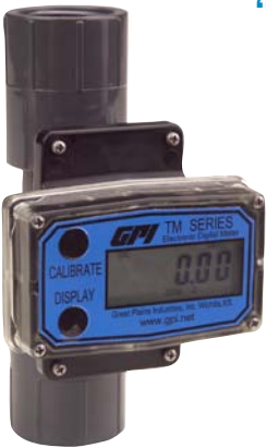
Shown with 90° Adapter (sold separately)