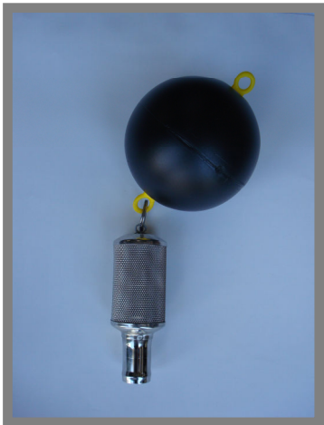
Coarse filter housing with .12 mesh and 2" (51) connection (WISY SZ9991)