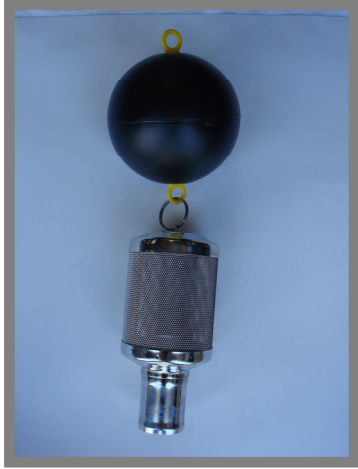
Coarse filter housing with .12 mesh and 1 1/4" (32) connection (WISY SZ9929)

Function: The floating filter is used to extract and filter rainwater out of the tank, cistern, pond or well.